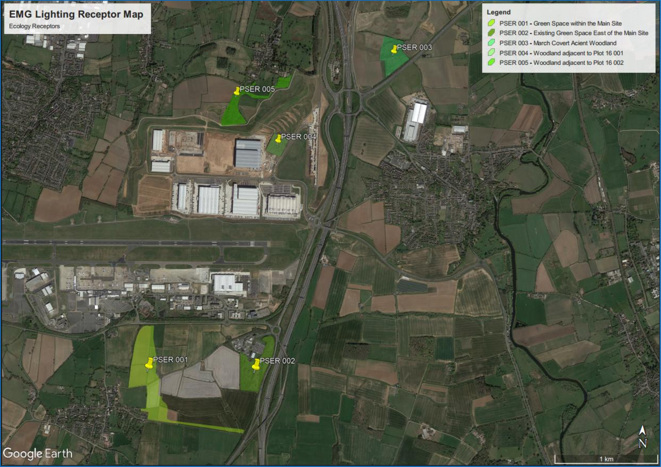
Figure 4: Ecology Receptors to Lighting