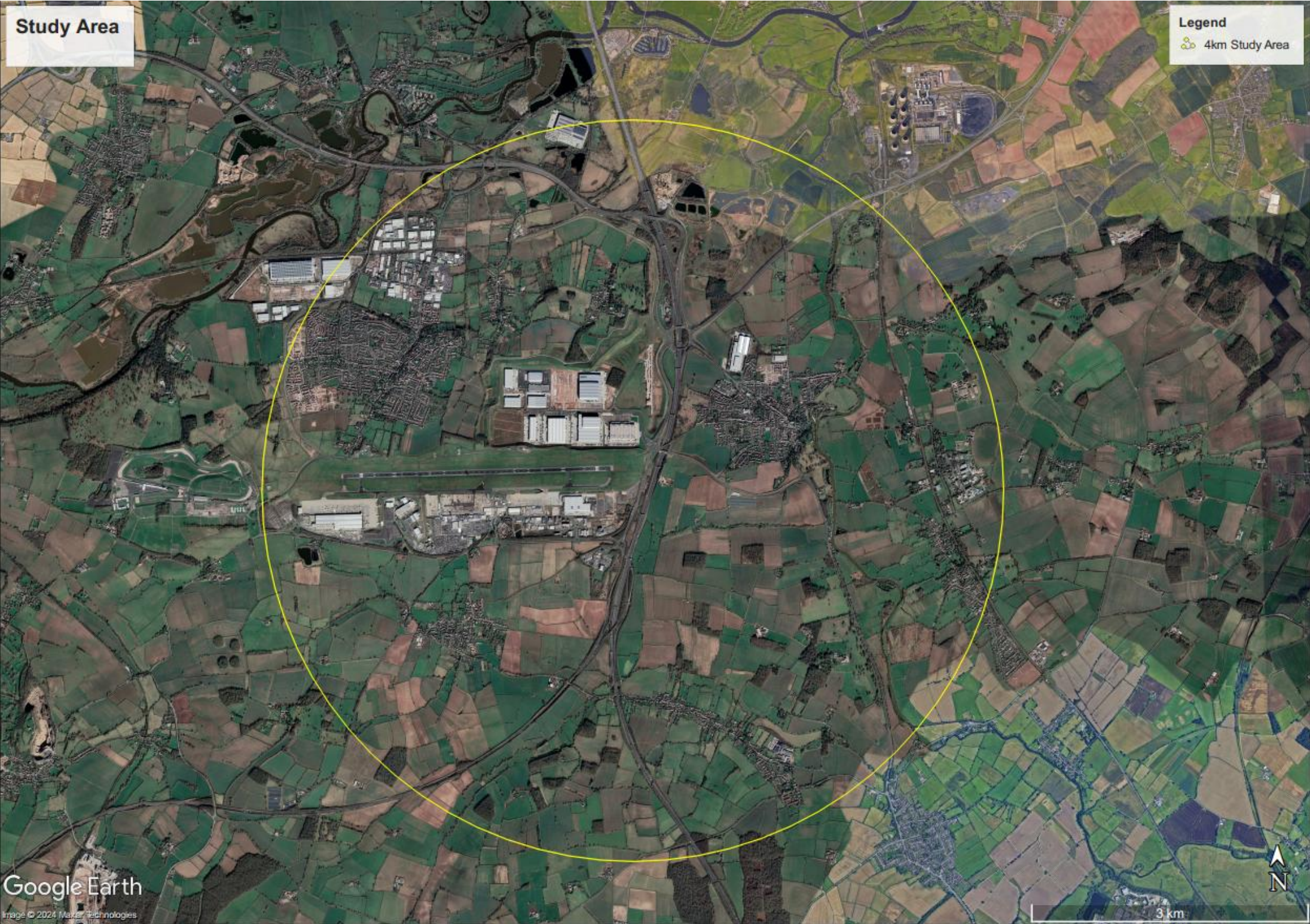
Figure 1: Study Area for Lighting